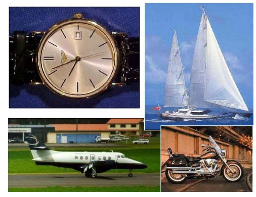
Fig.1 Some examples from Caltech 101 dataset [9].

In this session, we report our experimental results on Caltech 101 database [9]. In our experiments, we selected six categories, plus one background category as our training and test datasets. The training dataset included Cars side, Airplanes, Faces, Watch, Ketch, Motorbikes. Some sample images are shown in Fig. 1.