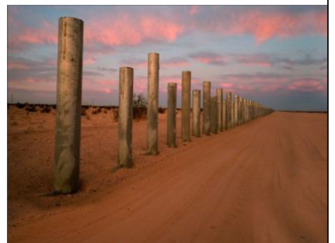
U.S.-Mexico Border National Geographic, May 2007